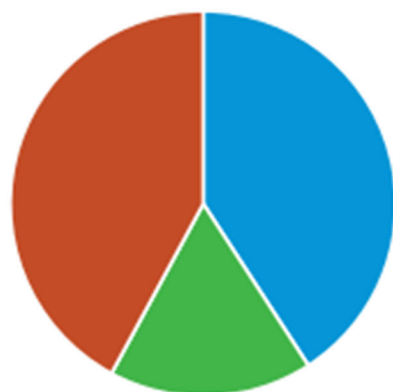
401(k) Balance by Source of Contributions