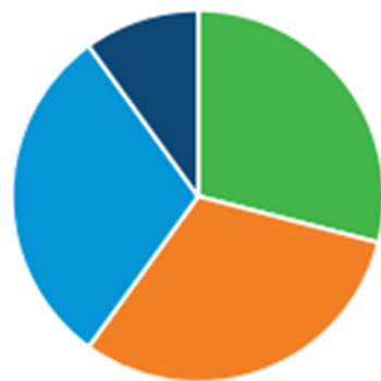
457 Asset Class Allocation

For more information about asset allocation, log in to GaBreeze.ga.gov . Choose Investments in the section below Savings & Retirement where you can find fund fact sheets, and Get Investment Help which will take you to an online investment evaluation tool with suggested allocations provided by Alight Financial Advisors.