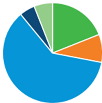
401(k) Asset Class Allocation

The plan's investment funds fall into major asset classes, which range from conservative to aggressive types of investments. The chart below shows your asset allocation, or how your money is divided among asset classes.